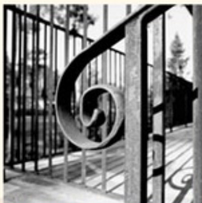
Hand-forged pure iron rails

Crowning a sunny hilltop, the Villas at Cortina seem almost to grow out of the landscape. Native stone and rough-sawn cedar planking find harmony in the surrounding mountain ridges, aspens and evergreens. Hand-forged iron rails please the eye and reward the touch. The knolltop location and southern exposure grace the Villas at Cortina with one of Telluride's rarest gifts: all-day sun . Hours before direct morning sun reaches the area's deep, narrow valleys, and long after evening shadows fall over most of Telluride's homes, the sun's light and warmth bathe the Villas at Cortina - with obvious benefits of reducing energy consumption. The residences are engineered for conservative use of energy in all four seasons. The windows, for example, are crafted in Europe, where insulation against the chill of Continental winters is a requirement, as important as beauty in architecture. In-floor radiant heat supplements the sun's warmth to provide a comfortable environment year around.