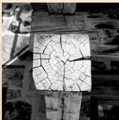
Rough-sawn cedar planking